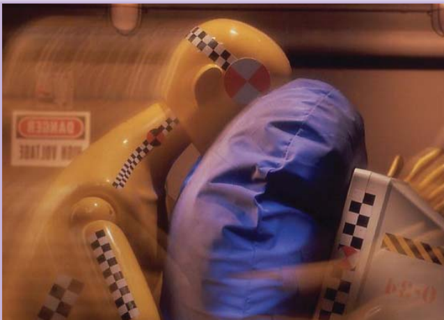
Airbag impact test